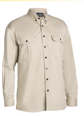
BS6255 MINI TWILL SHIRT LS