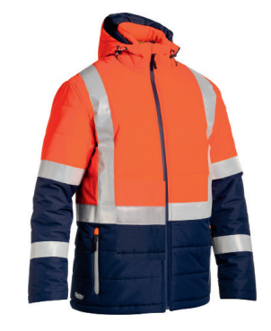
BJ6929HT TAPED 2T HI VIS PUFFER JACKET w/ ADJUSTABLE HOOD