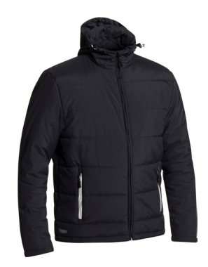
BJ6928 PUFFER JACKET w/ ADJUSTABLE HOOD