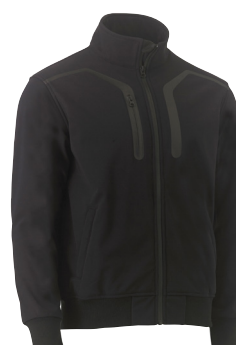
BJ6960 PREMIUM SOFT SHELL JACKET