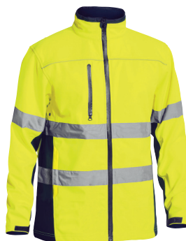
BJ6059T TAPED HI VIS SOFT SHELL JACKET