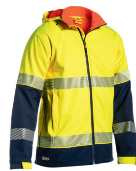
BJ6934T 3M 2T HI VIS RIPSTOP SOFTSHELL JACKET