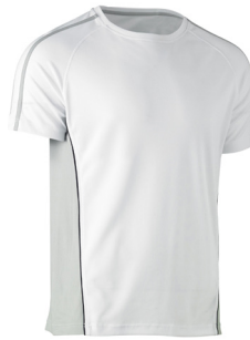
BK1424 PAINTER'S CONTRAST TEE