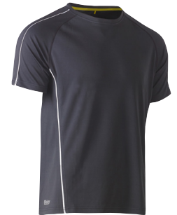
BK1426 COOL MESH TEE