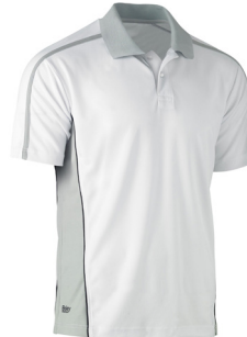
BK1423 PAINTER'S CONTRAST POLO SHIRT SS