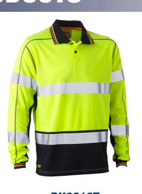
BK6219T TAPED 2 TONE HI VIS POLYESTER MESH POLO LS