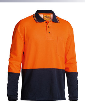
BK6234 2 TONE HI VIS POLO SHIRT LS