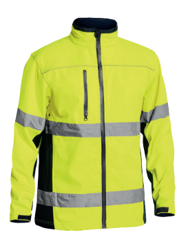
BJ6059T TAPED 2T HI VIS SOFT SHELL JACKET