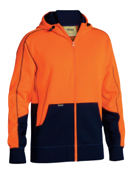
BK6819 2T HI VIS FLEECE HOODIE