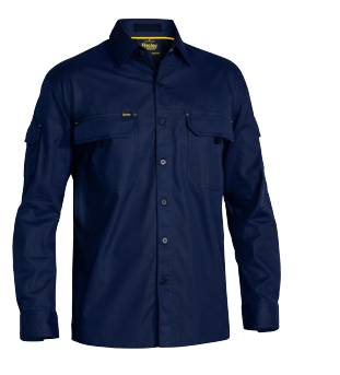
BS6414 X AIRFLOW™ RIPSTOP SHIRT LS

What is UPF rating of the fabric on this shirt? ALL COLOURS: UPF 40