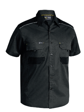
B$1415T B$1133 3M TAPED 2T HI VIS X AIRFLOW<sup>TM</sup> FLX & MOVE<sup>TM</sup> RIPSTOP SHIRT SS MECHANICAL STRETCH SHIRT SS