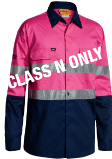
BS6896 _ TT32

3M TAPED 2T HI VIS COOL L/W SHIRT COMPLIES TO 4602.1:2011 CLASS N: NIGHT USE ONLY