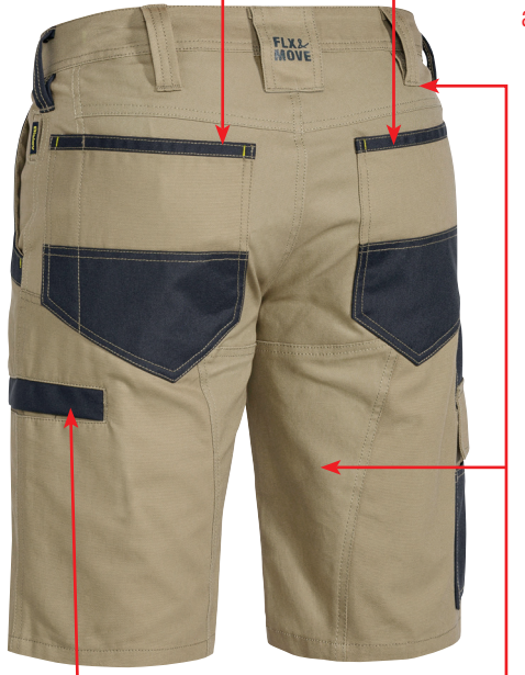
LHS leg welt pocket

Stretch panels at back yoke, back hip and inner thighs panel