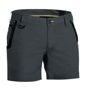
BSH1131 FLEX & MOVE SHORT