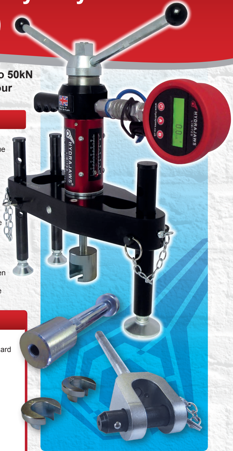
Note: Export testers feature a detachable gauge.

To sustain a 50kN load a new robust bridge design has been made which is denser in profile. It features three telescopic legs with pin arrangement in six positions and 30mm of fine adjustment at the base.